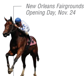
New Orleans Fairgrounds Opening Day, Nov. 24

NOV. 24. Opening Day (horse racing); New Orleans Fair Grounds. Information, FairGroundsRaceCourse.com .