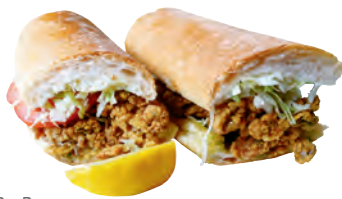
Po-Boy Preservation Festival, Oct. 2

NOV. 21. Lykke Li and First Aid Kit; Tipitina's Uptown. Information, Tipitinas.com .